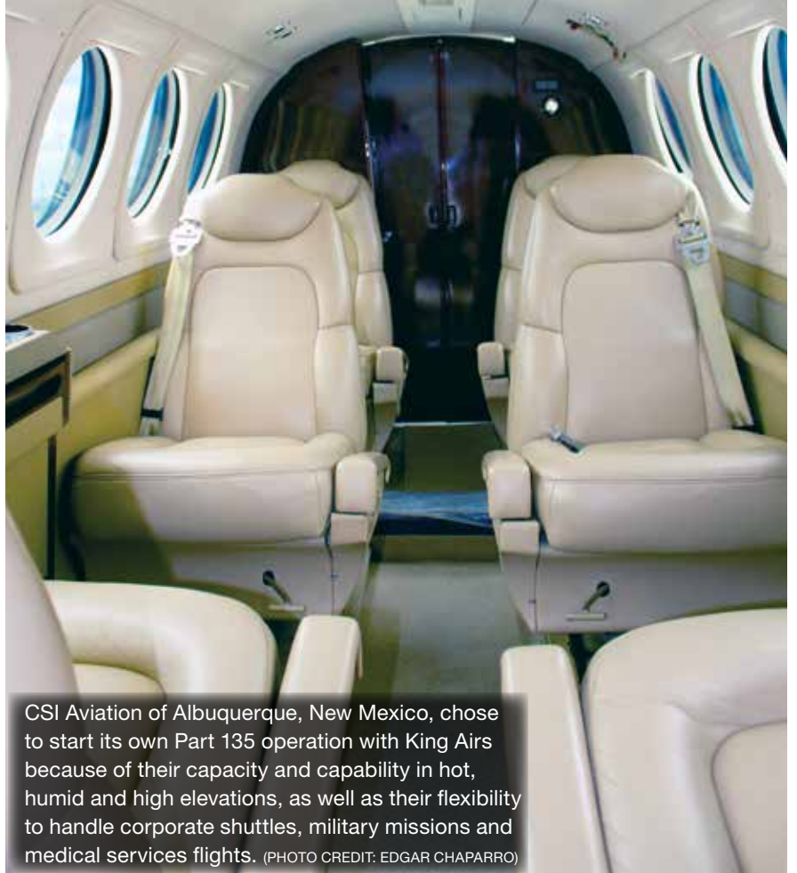
CSI Aviation of Albuquerque, New Mexico, chose to start its own Part 135 operation with King Airs because of their capacity and capability in hot, humid and high elevations, as well as their flexibility to handle corporate shuttles, military missions and medical services flights.

"The King Air is the ideal aircraft and has the performance needed to operate in this area of the country," Fishburn said. "New Mexico presents unique challenges for aviation. We have unexpected weather conditions, mountainous terrain, remote airfields and short