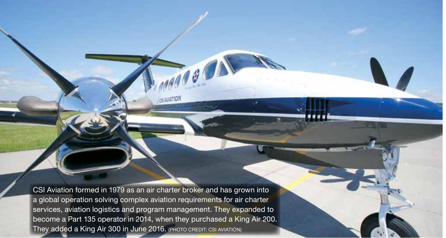
CSI Aviation formed in 1979 as an air charter broker and has grown into a global operation solving complex aviation requirements for air charter services, aviation logistics and program management. They expanded to become a Part 135 operator in 2014, when they purchased a King Air 200. They added a King Air 300 in June 2016.

these aircraft,” he said. “We manage everything about those flights. Most are flying five days a week, eight hours a day and we procure all the fuel, set up all the ground handling, coordinate all the international permitting, provide crew rotation and travel, and manifesting. So this is second nature to us.”